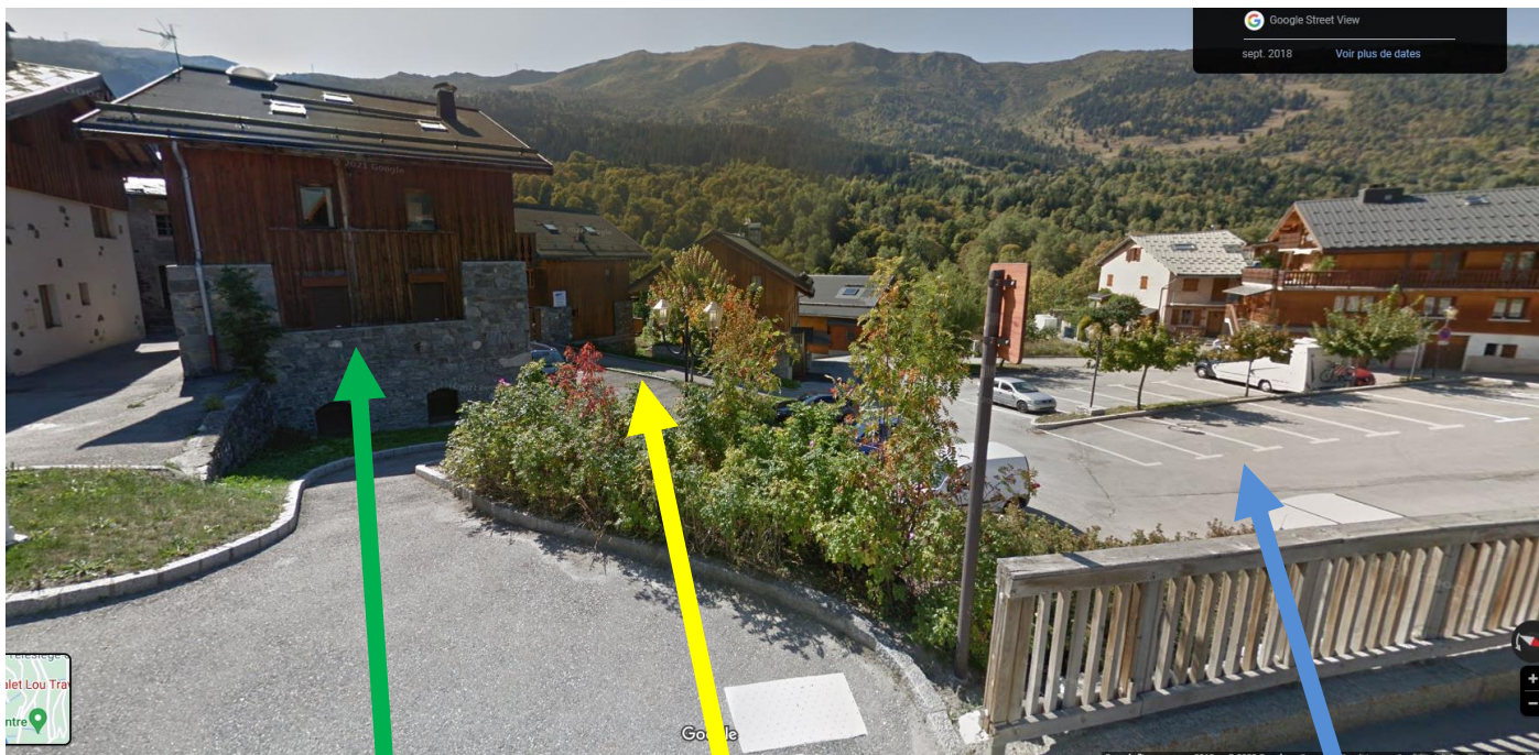
Chalet Lou Travé

There is room to park 2 cars in front of the chalet.