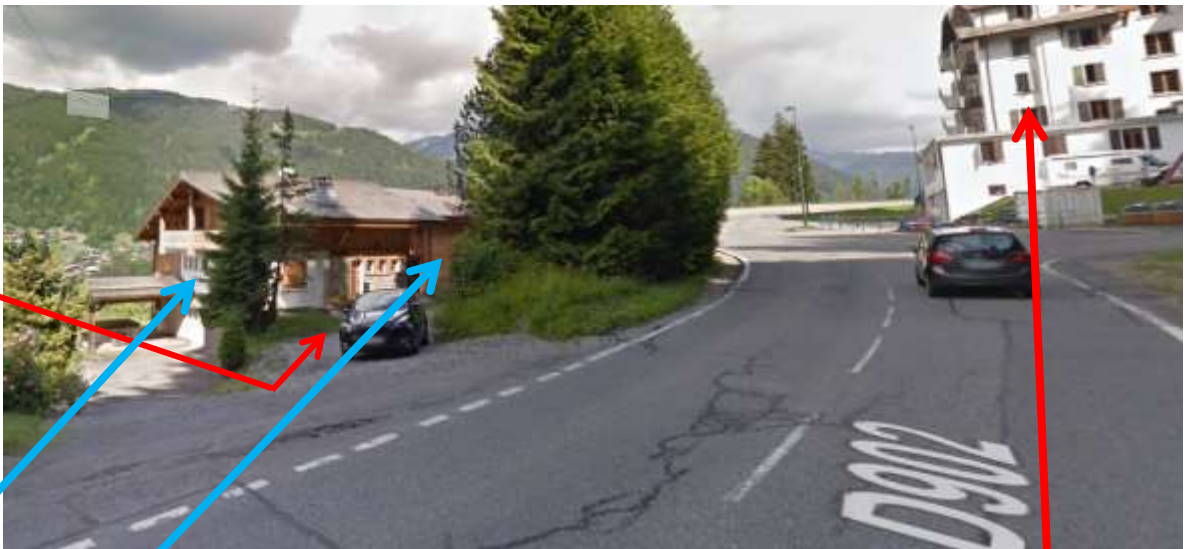
Hôtel Foyer de Savoie

The next is Chalet Austin (behind the tree on this image)