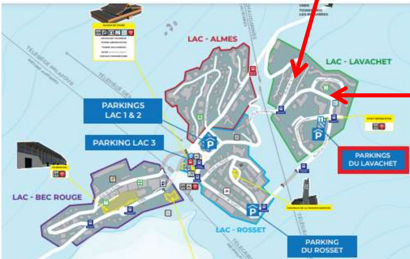
Chalet Marilyn is here on this small map

The Le Lavachet Car Park is located about 350m (a 1-minute drive) from Chalet Marilyn.